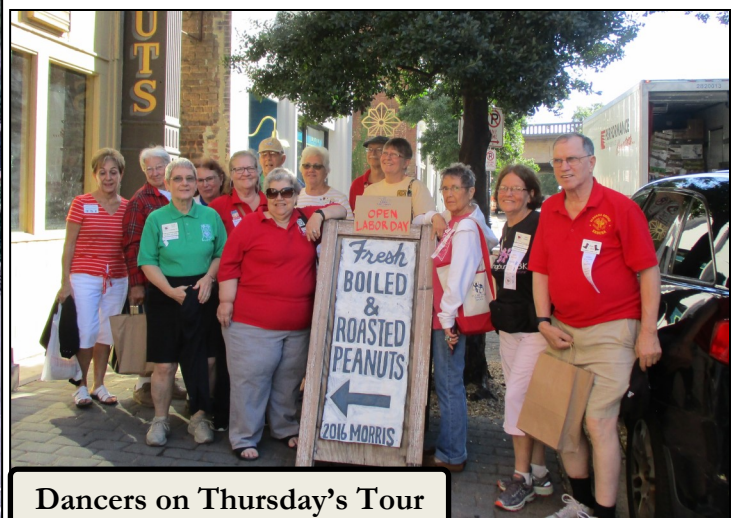
Dancers on Thursday's Tour