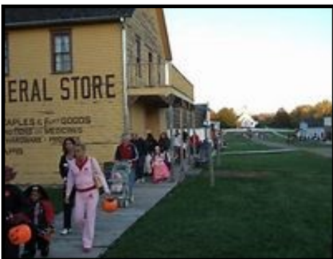
LIVING HISTORY FARMS