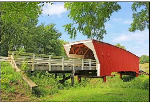
BRIDGES OF MADISON COUNTY