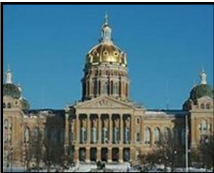
IOWA STATE CAPITOL