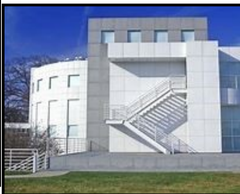
DES MOINES ART CENTER