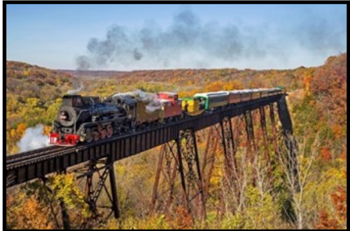
BOONE SCENIC VALLEY RAILROAD