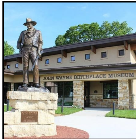
BIRTHPLACE OF JOHN WAYNE MUSEUM