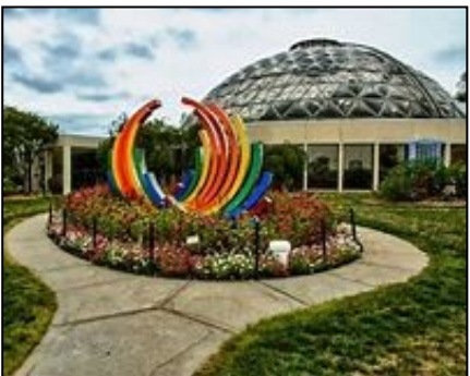
GREATER DES MOINES BOTANICAL CENTER