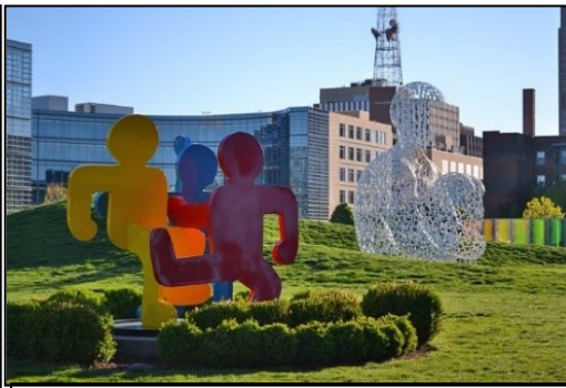
PAPPAJOHN SCHULPTURE PARK