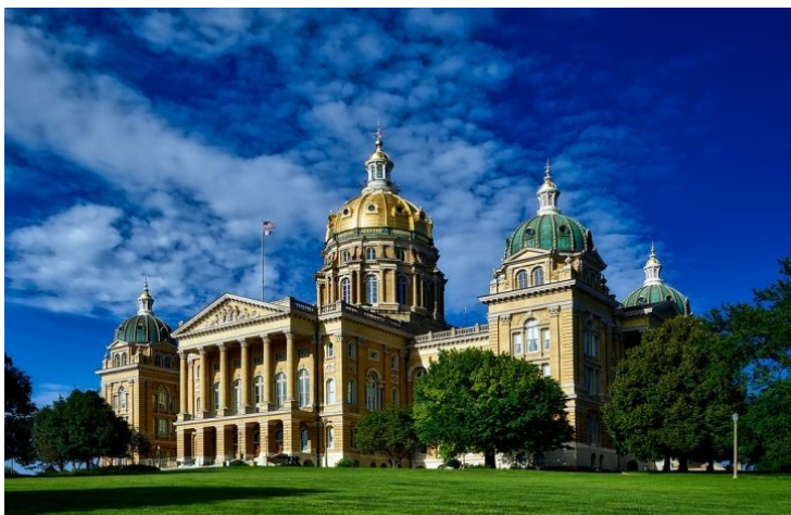
Iowa State Capitol 1007 E Grand Ave, Des Moines, IA 50319