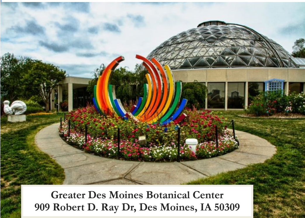
Greater Des Moines Botanical Center 909 Robert D. Ray Dr, Des Moines, IA 50309

As the name implies, the Greater Des Moines Botanical Center is yet another one of the top Iowa attractions that is located in the capital city. With its location by downtown, the botanical gardens give you a chance to escape with temperate and tropical gardens.