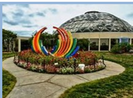
Greater Des Moines Botanical Center