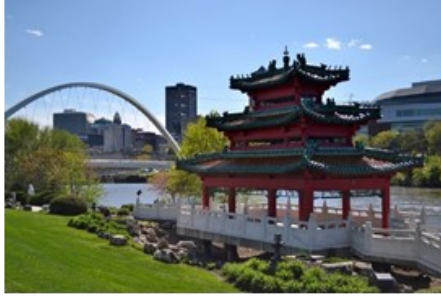
Robert D Ray Asian Gardens