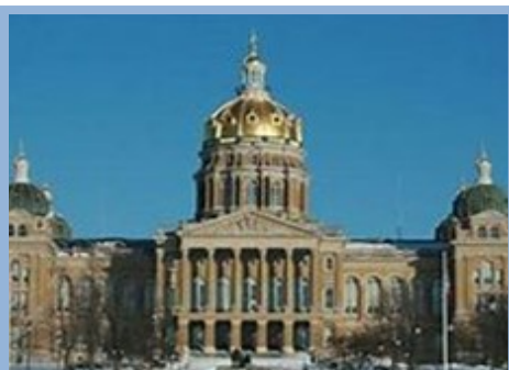
Iowa State Capitol Building