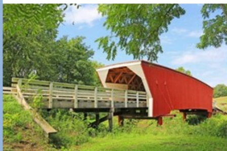
Bridges of Madison County