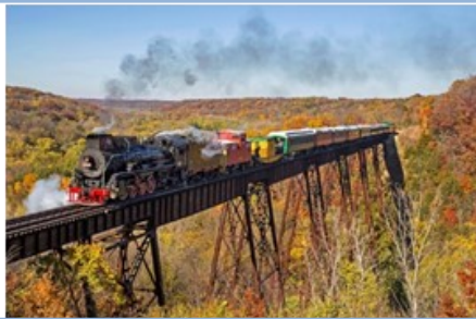
Bone Scenic Valley Railroad