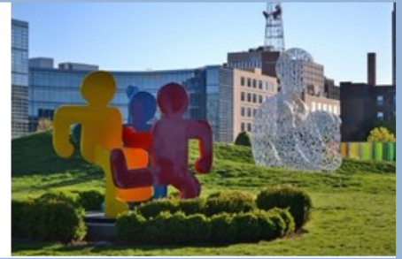
Pappajohn Sculpture Park