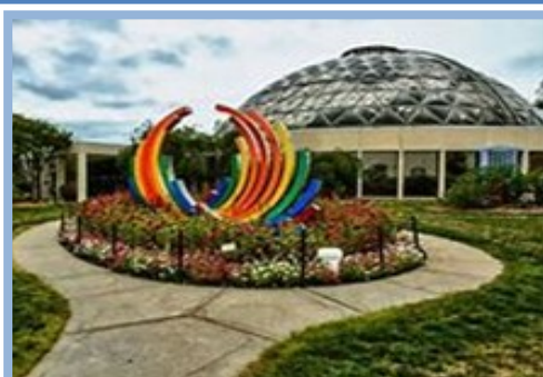
Greater Des Moines Botanical Center