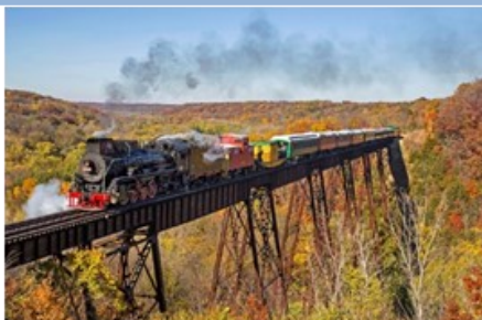
Boone Scenic Valley Railroad