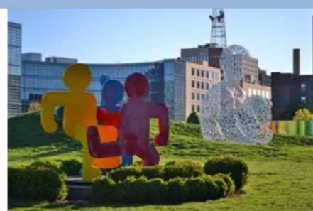
Pappajohn Sculpture Park