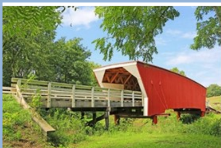
Bridges of Madison County