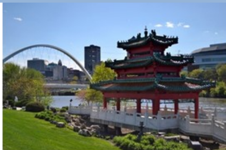
Robert D Ray Asian Gardens