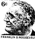
FRANKLIN D. ROOSEVELT